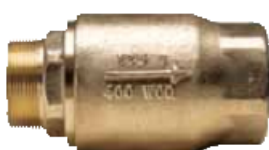
61-200 Male x Female Threaded 1/4" through 2"