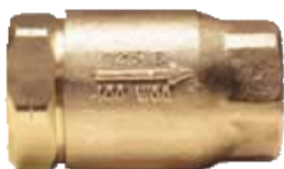
61-100 Female x Female Threaded 1/4" through 3"